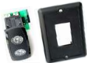
BLACK GRAY GALLEY