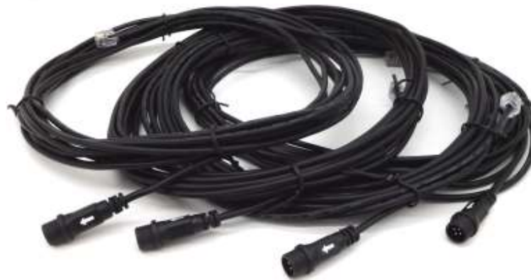
4 x IP66-2, Interface Cables, 20 Ft. PN 5955-IP66-20