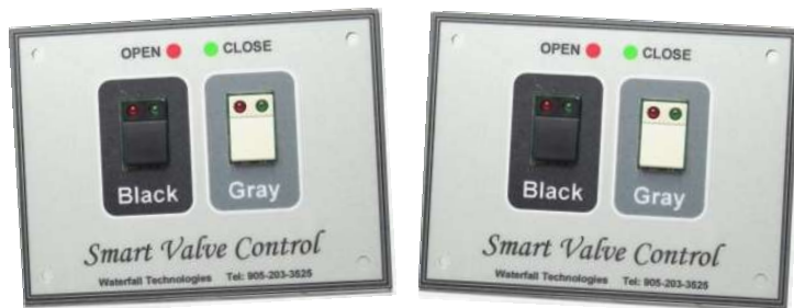
2 x Double Switch Panels PN 5847- RV Dbl Sw Pnl