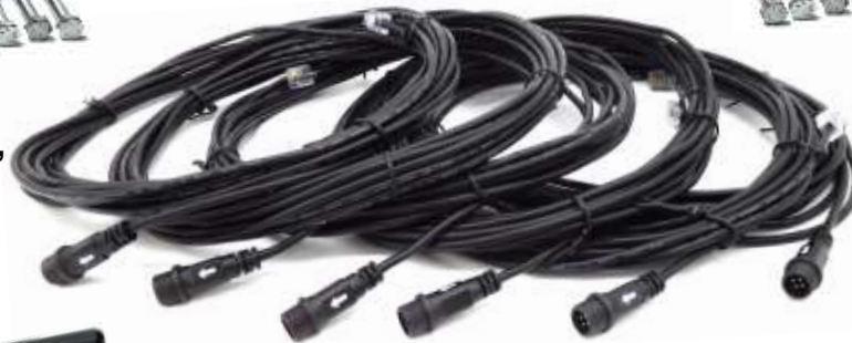
6 x IP66-2, Interface Cables, 20 Ft. PN 5955-IP66-20