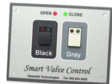
2 x Double Switch Panels PN 5847- RV Dbl Sw Pnl