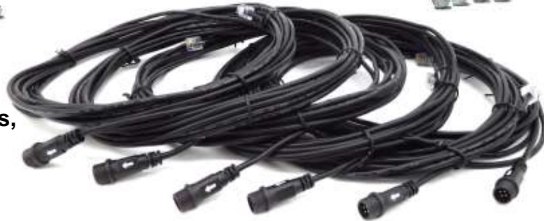
6 x IP66-2, Interface Cables, 20 Ft. PN 5955-IP66-20