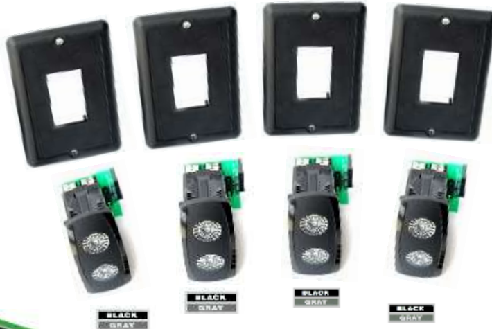
4 x Single Switches (Carlingtech) PN 5787- DM30- SVT