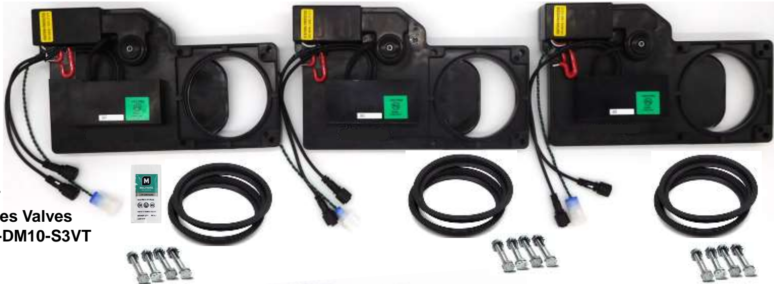
3 x S3VT Pro-Series Valves PN 6009-DM10-S3VT

Provides everything to install 3 Valves on 3 tanks and operate from 2 Double Switch Panels and 1 Single Switches