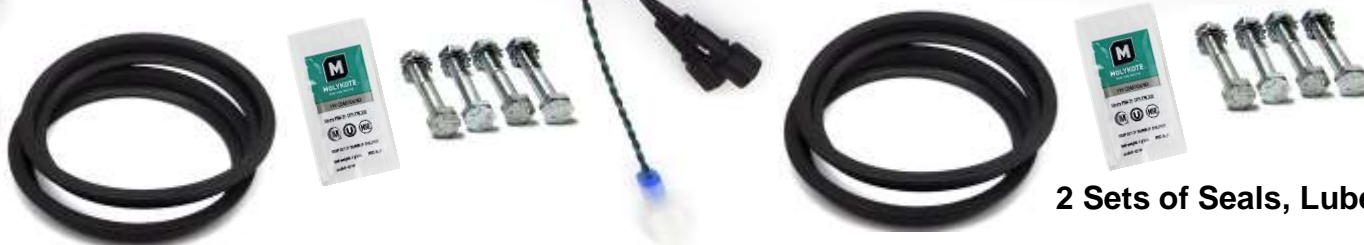
2 Sets of Seals, Lube & Hard Ware