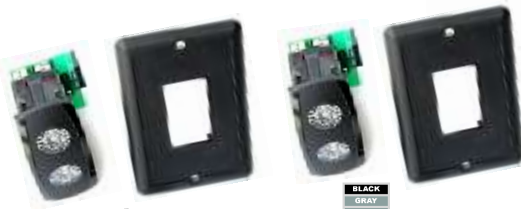
2 x Single Switches (Carlingtech) PN 5787- DM30- SVT