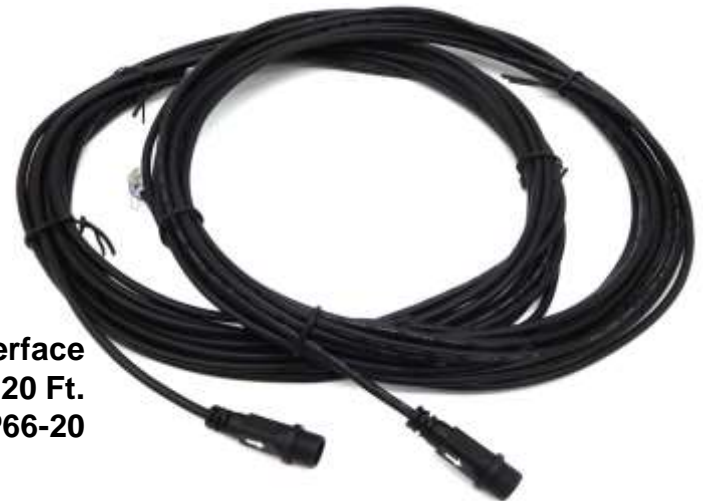
2 x IP66-2, Interface Cables, 20 Ft. PN 5955-IP66-20