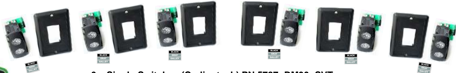
6 x Single Switches (Carlingtech) PN 5787- DM30- SVT