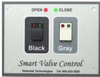
1 x Double switch Panel PN 5847- RV Dbl Sw Pnl