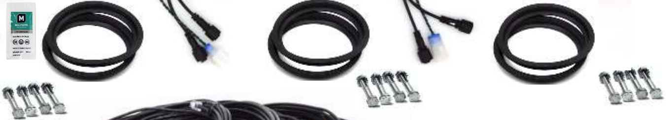
3 Sets of Seals, Lube & Hard Ware