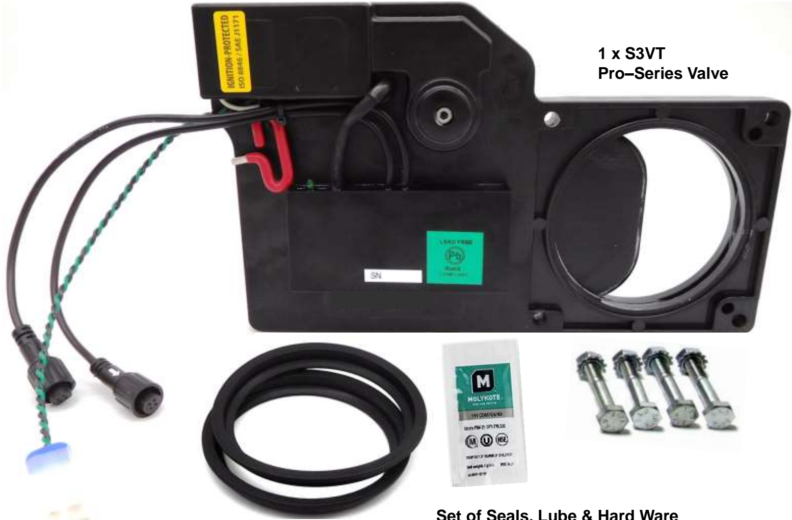
Set of Seals, Lube & Hard Ware