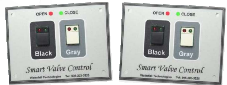
2 x Double Switch Panels PN 5847- RV Dbl Sw Pnl