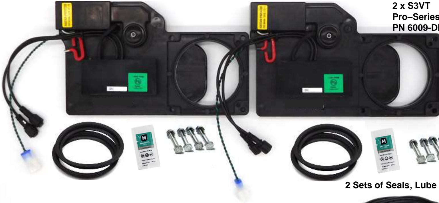
2 x S3VT Pro-Series Valves PN 6009-DM10-S3VT

Provides everything to install 2 Valves on 2 tanks and operate from a Double Switch Panel