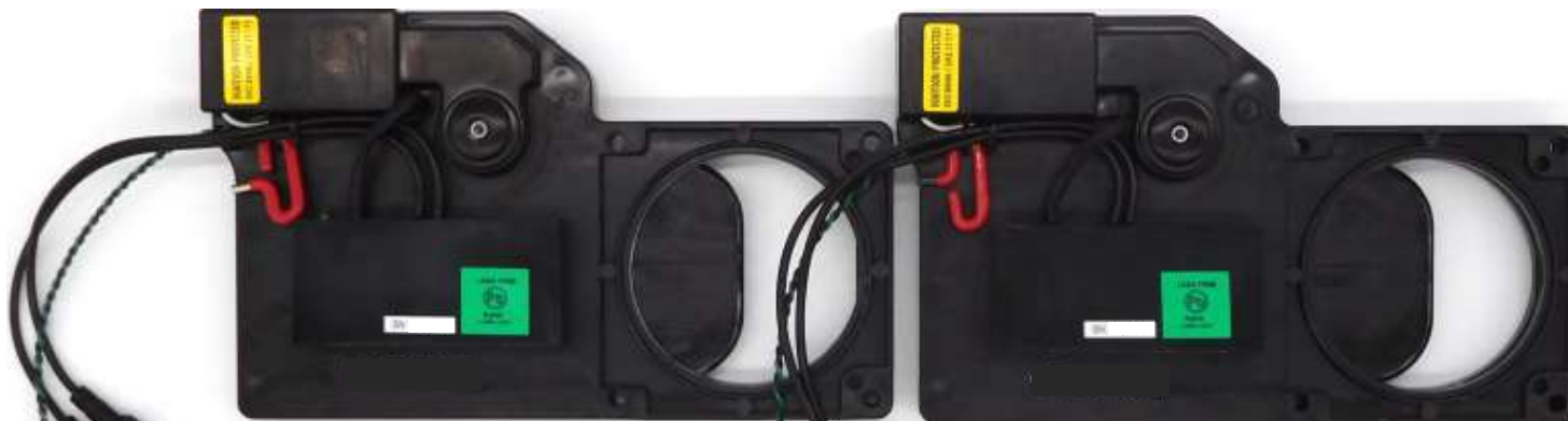
2 x S3VT Pro-Series Valves PN 6009-DM10-S3VT

Provides everything to install 2 Valves on 2 tanks and operate from 2 Double Switch Panels