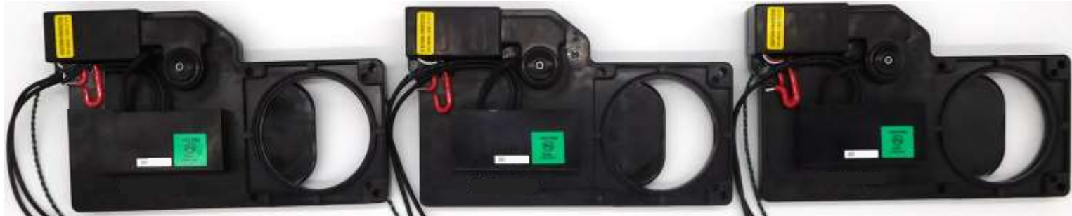
3 x S3VT Pro-Series Valves PN 6009-DM10-S3VT

Provides everything to install 3 Valves on 3 tanks and operate from 2 Double Switch Panels and 2 Single Switches