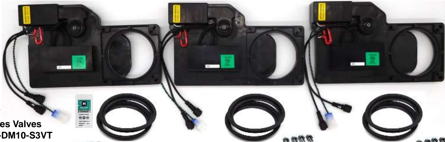
3 x S3VT Pro-Series Valves PN 6009-DM10-S3VT

Provides everything to install 3 Valves on 3 tanks and operate from 6 Single Switches