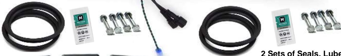
2 Sets of Seals, Lube & Hard Ware